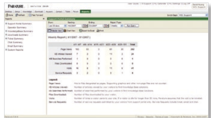
Make it easy for your IT Support team to deliver comprehensive help desk support with an integrated dashboard.